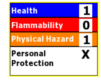
HMIS RATINGS (0-4)