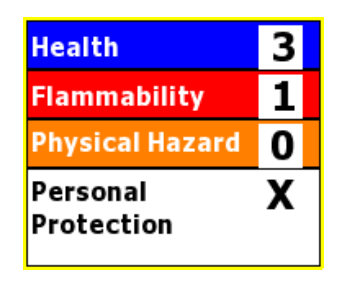
HMIS RATINGS (0-4)