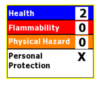
HMIS RATINGS (0-4)