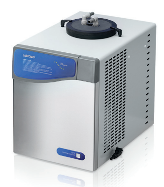
CentriVap -84° C Cold Trap