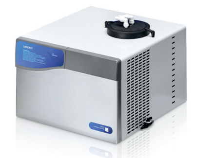
CentriVap -105° C Cold Trap