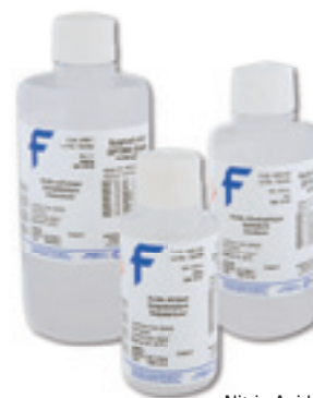
Nitric Acid packaging

The highest purity of acids and bases for ultra-trace metal analysis. All products are certified below 100 parts per trillion (ppt or pg/g) with critical impurities specified at 1 ppt level. This range contains the fewest trace metallic impurities of any other acid. Our Optima Acids are tested for up to 65 elements at ppt levels using the Thermo Scientific™ Element™ 2 High Resolution ICP-MS.