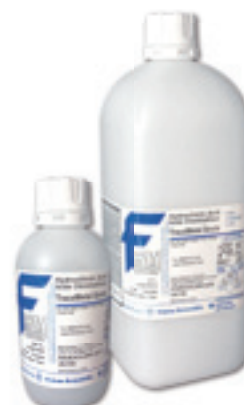
A508-P500 and A508-P212